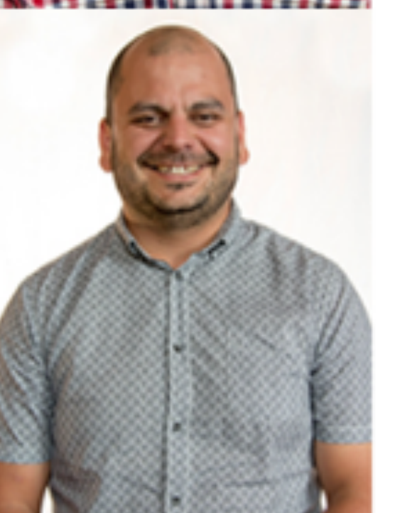
Chaplain Mountain View Adventi College