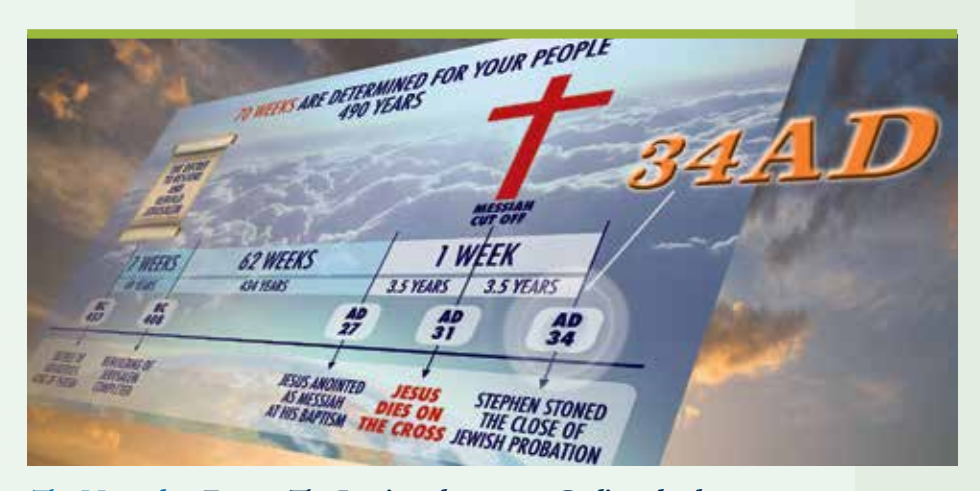
The Messiah – Fact 8: The Jews' probation as God's only chosen people ended in 34AD